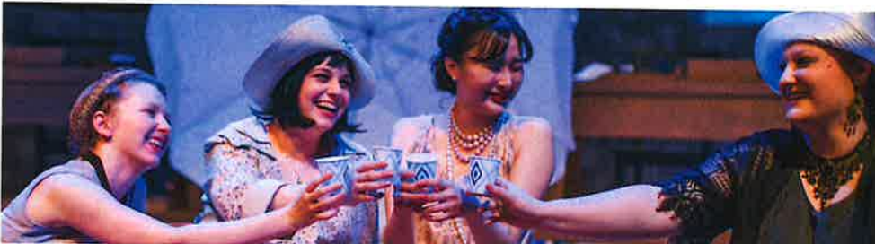
THESE SHINING LIVES

IT'S ALL ABOUT YOU. APPLY TODAY AT MY.EIU.EDU .