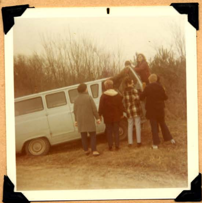
All right, who backed the truck in the ditch?