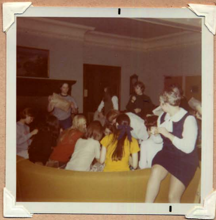
Everyone was busy