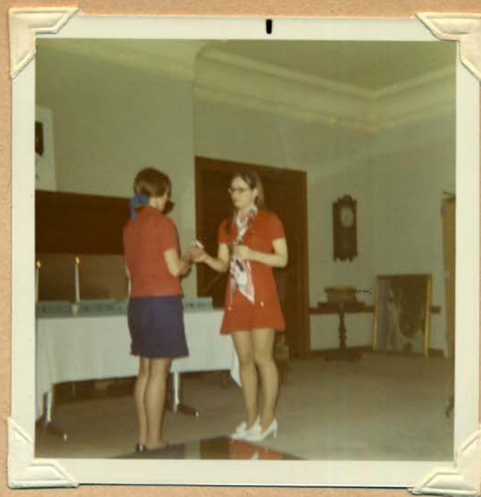
A charm for the old.