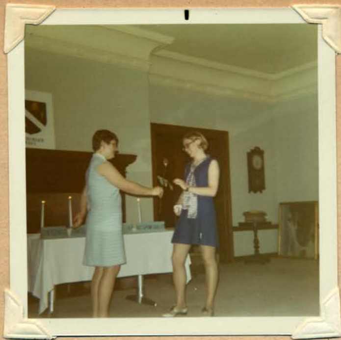
A rose for the new officers