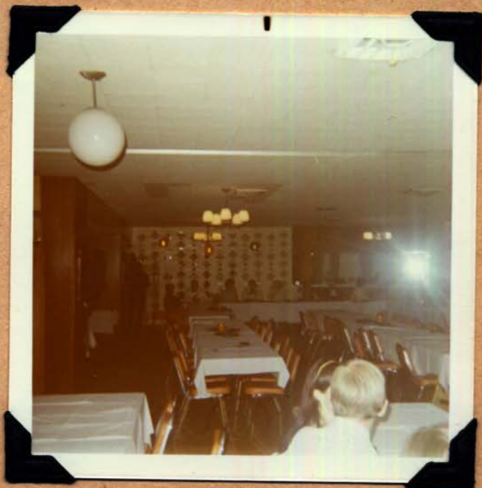
The officials were at the head table.