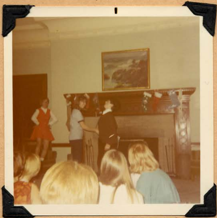
Another commercial. 2nd Old West