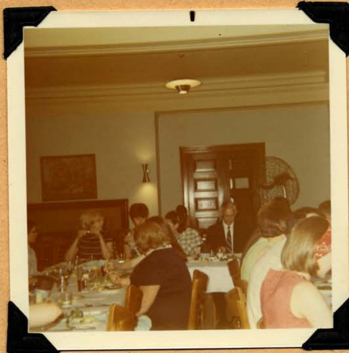
We started with dinner.