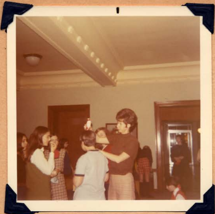
Miss D showing the decoration she brought