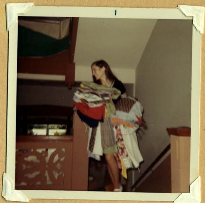
Will I ever make it?