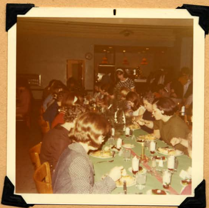
Finally the dinner.