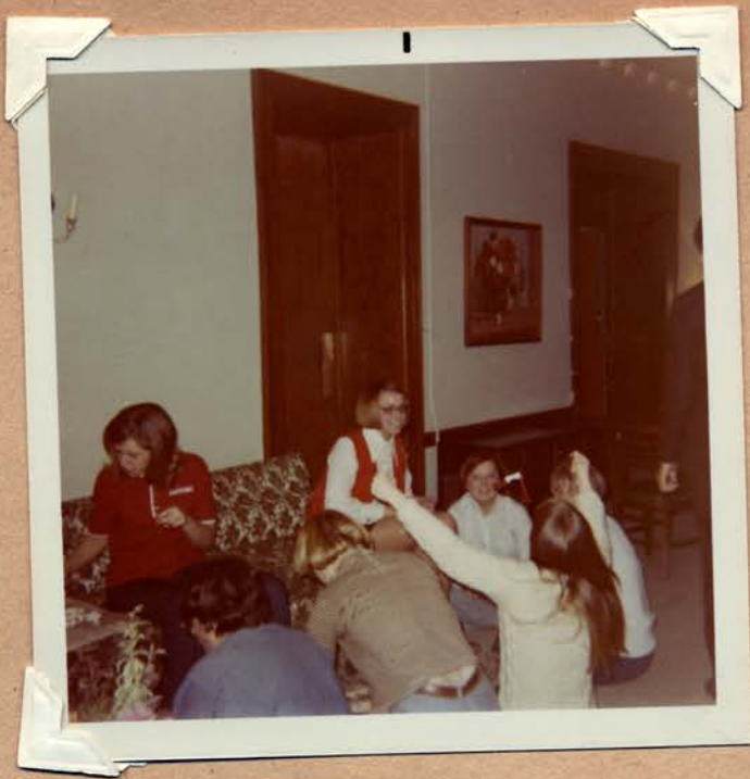
We string cranberries and popcorn.