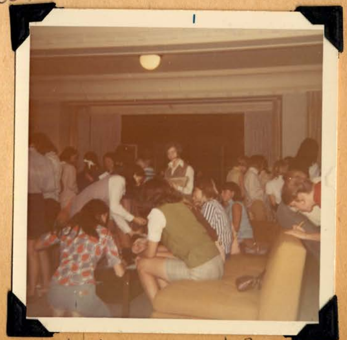
What time is it?