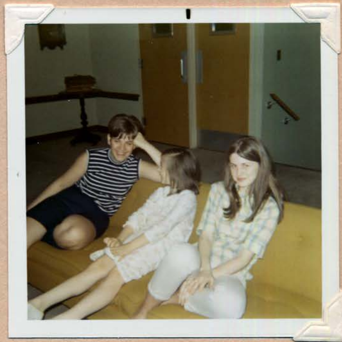
You don't say.