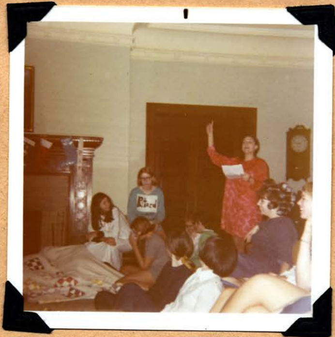
The night before Christmas in Pem Pit