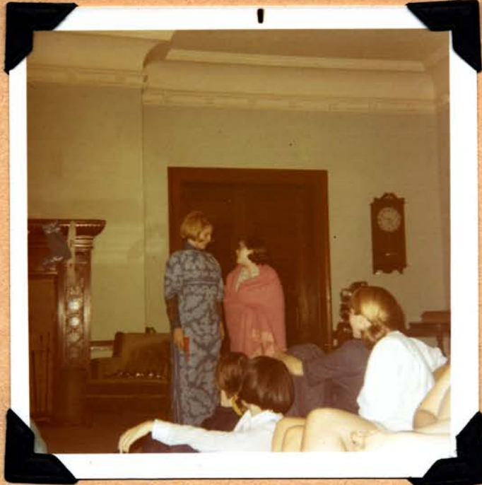
Sos Pad wins again 2nd Old West