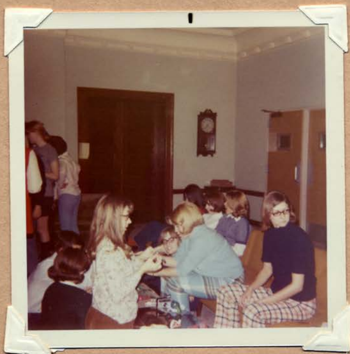
Some made chains.