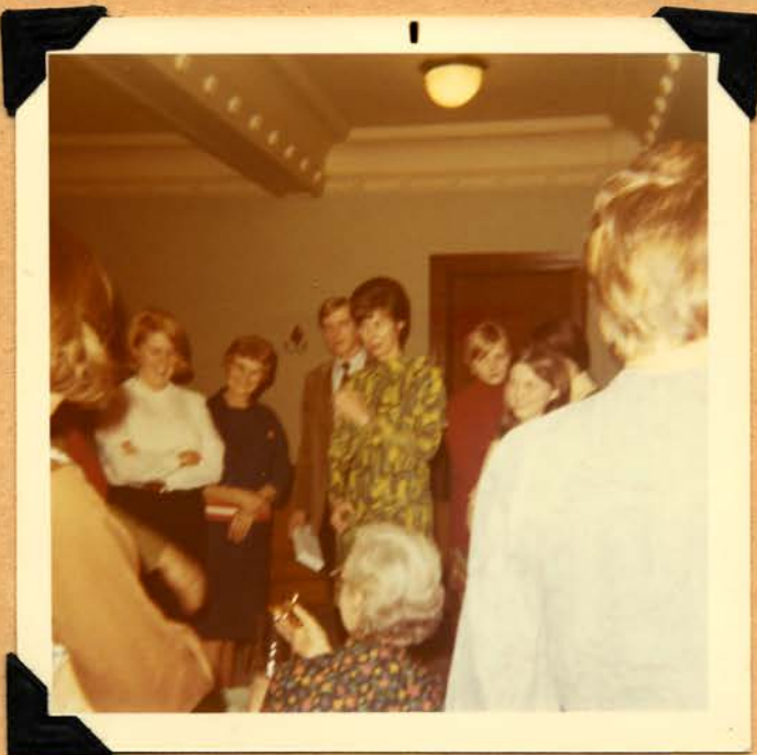
Admiring the gifts