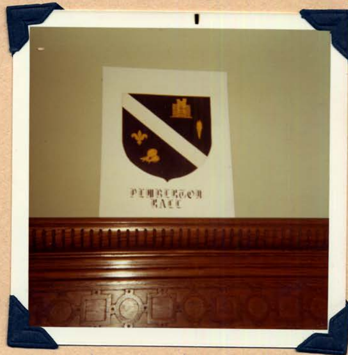
That looks better!