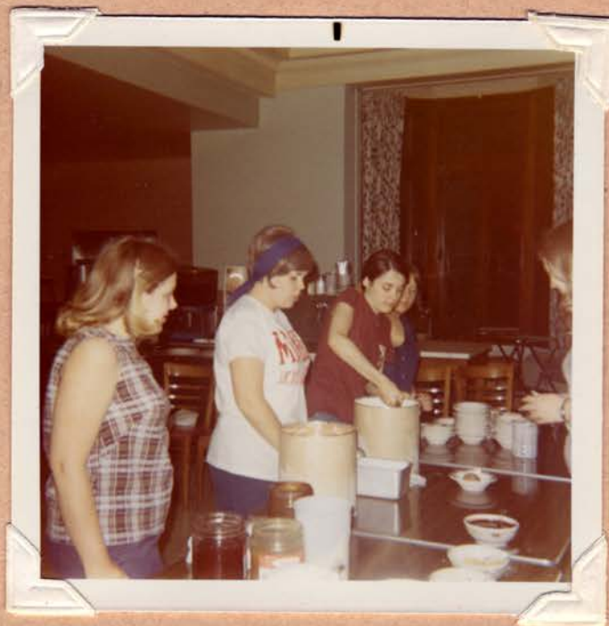
Want some ice cream?