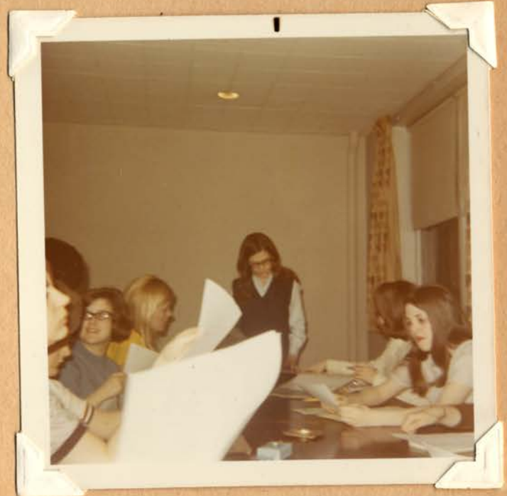
A Hall Council meeting