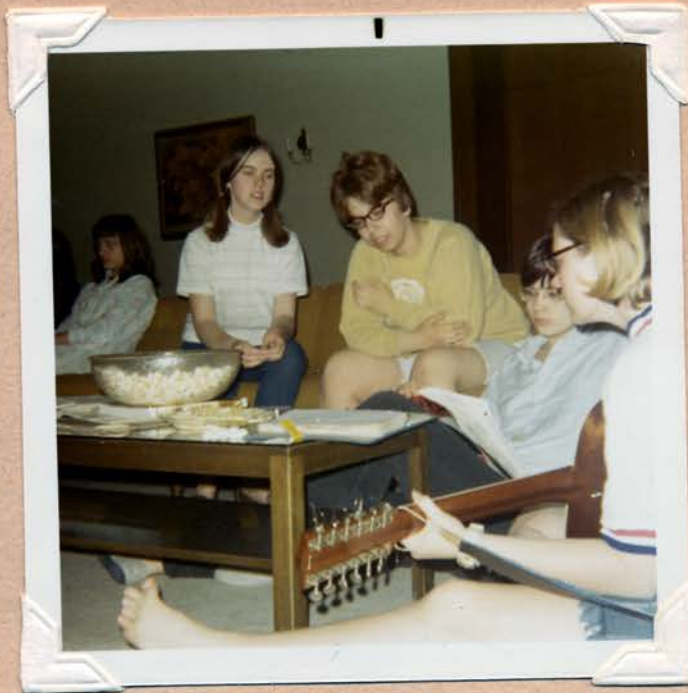
Singing together is always fun.