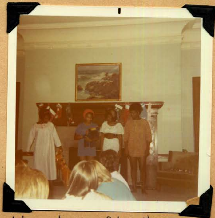
We love Christmas.