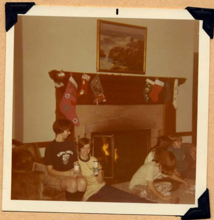
A roaring fire added to the Christmas spirit.