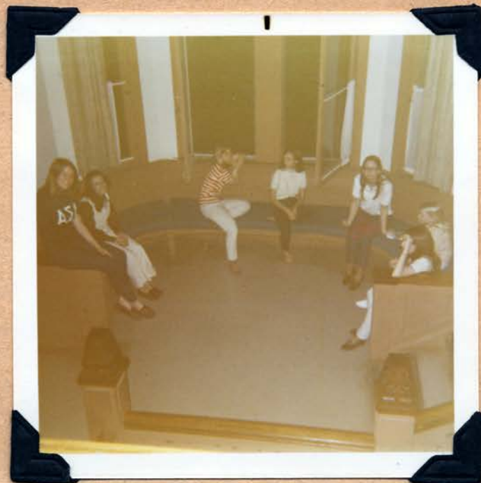
Waiting for the sis's.