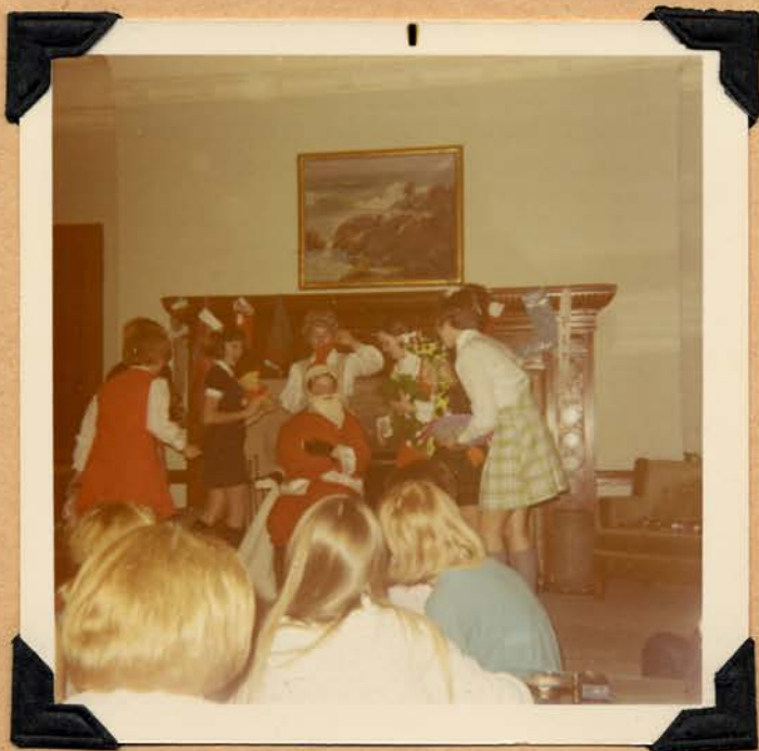
A visit with Santa. 3rd Old South