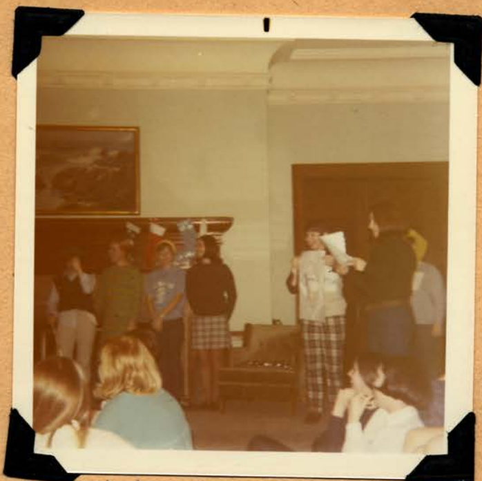
3rd Nu's version of Pem's night before Christmas