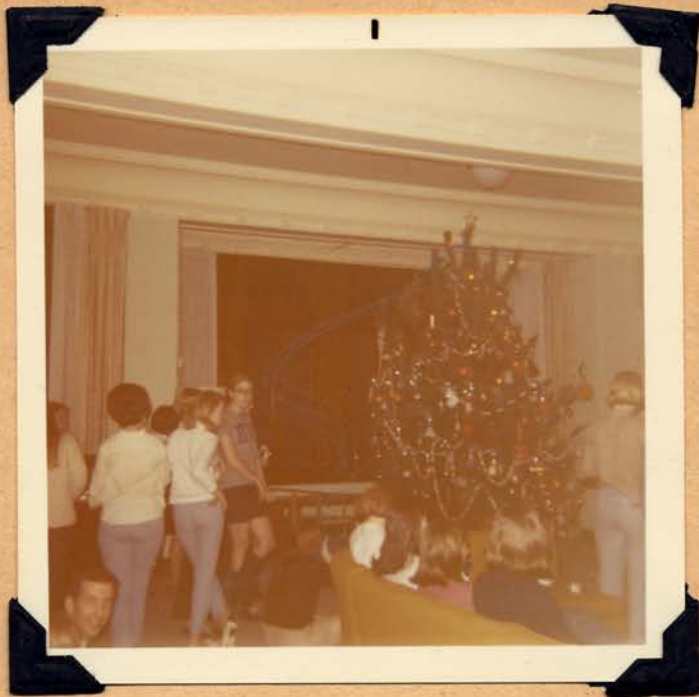
The finished product.