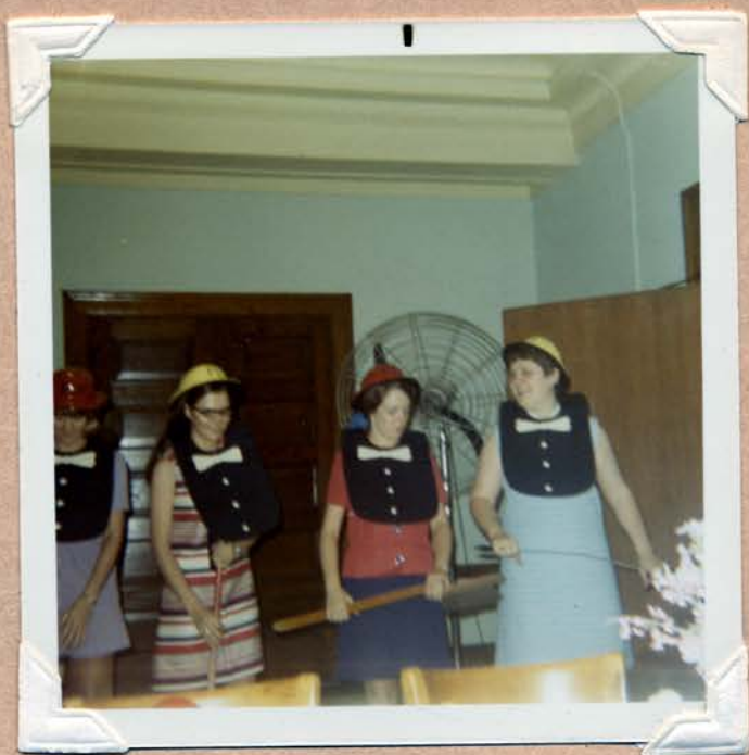
There's no business like dorm business