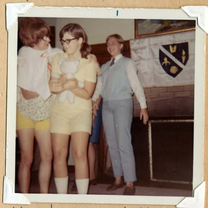
You're an adult now little girl.