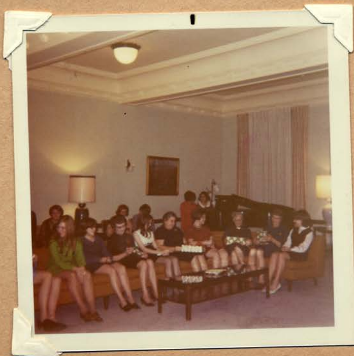
Opening their gifts.