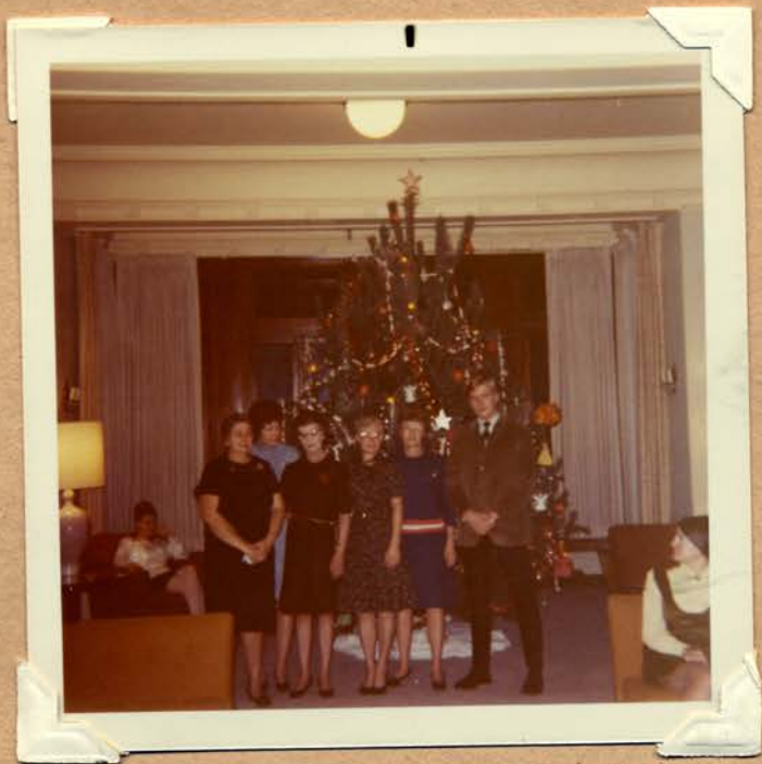
These are our maids