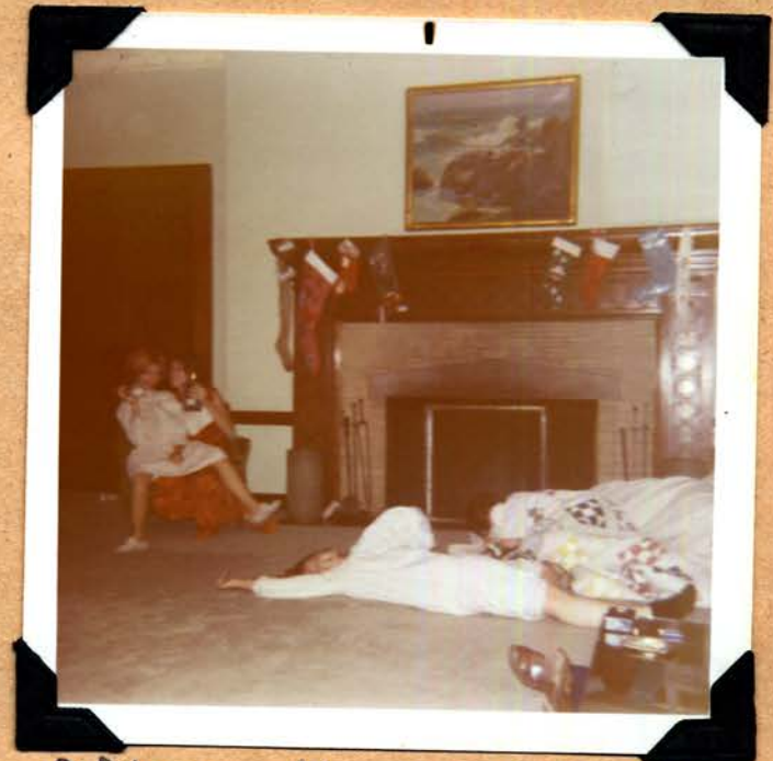
After the party's over. Pit