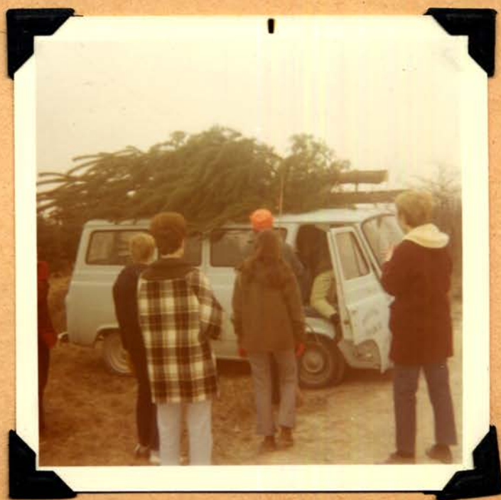
All ready to go.