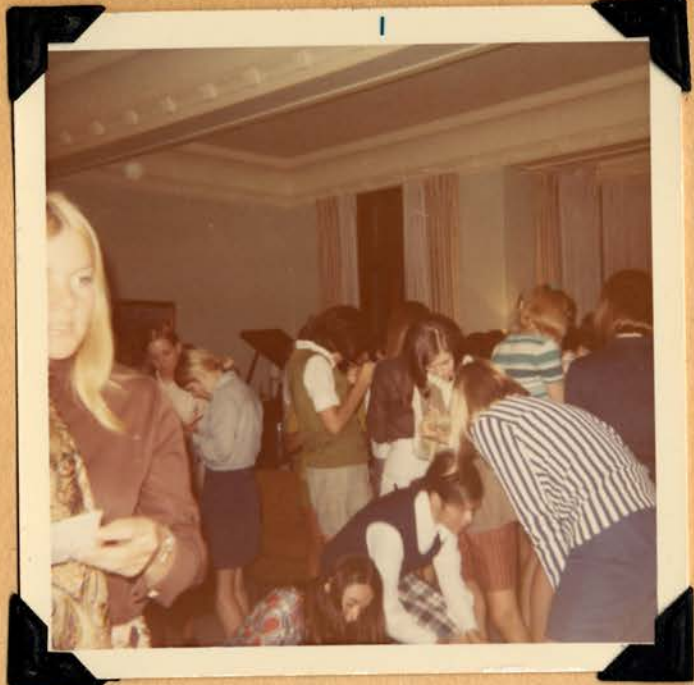
The clock game.