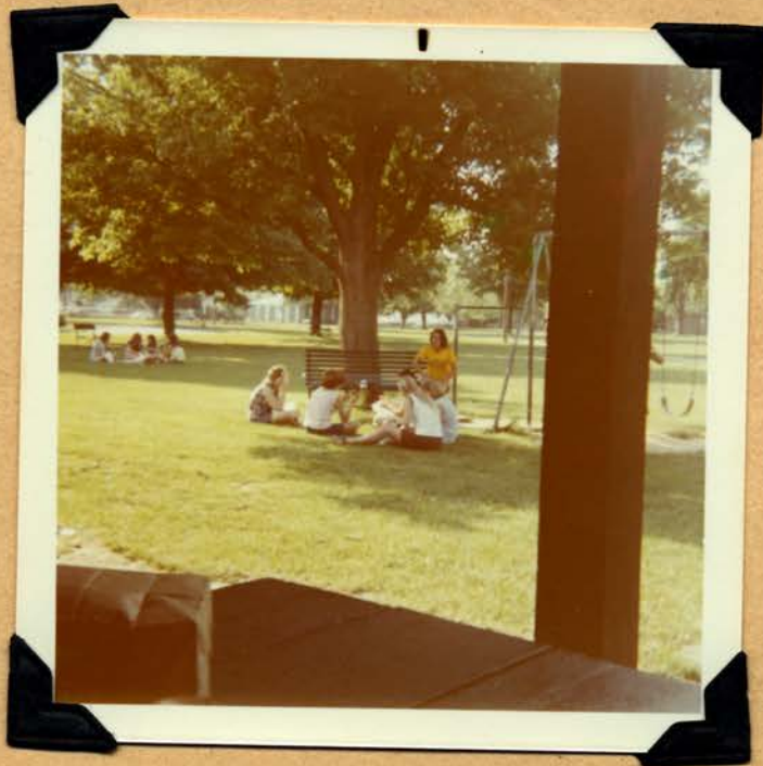
It was a beautiful day!