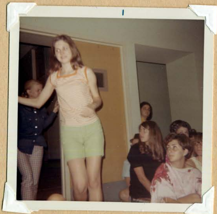
Here I am.