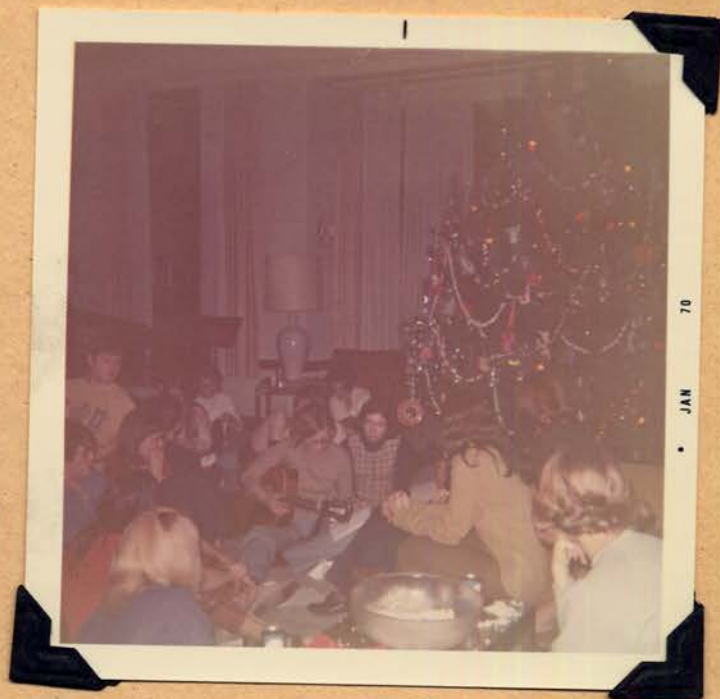
Everyone had a good time singing afterwards!