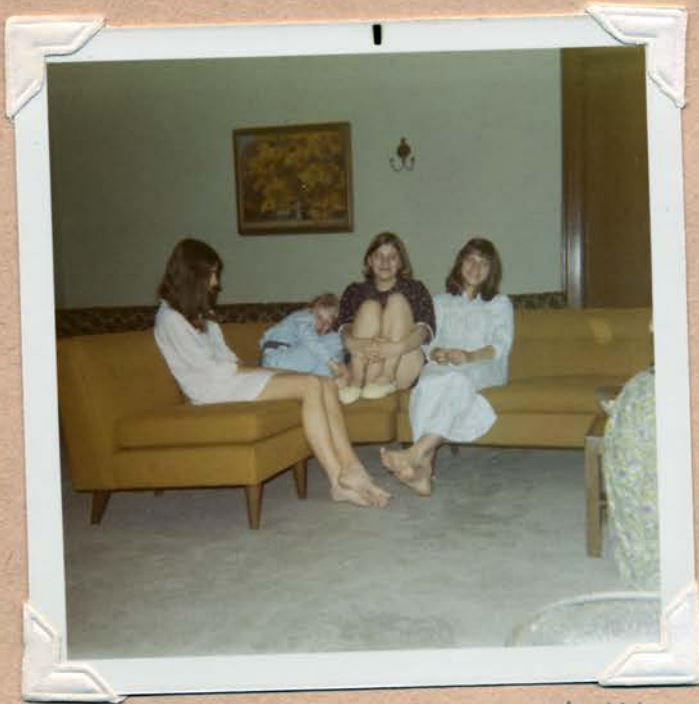
Which one's the little Sis.