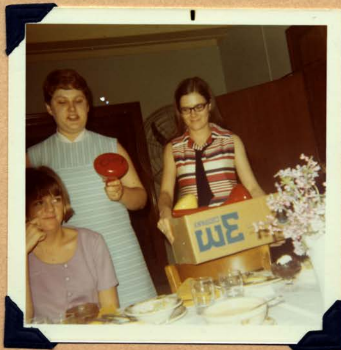
For all your "bright" ideas