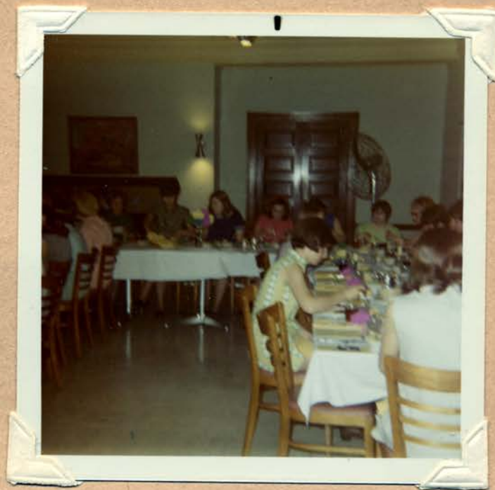
First the meal.