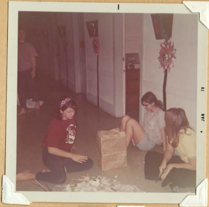
Working on door decs.