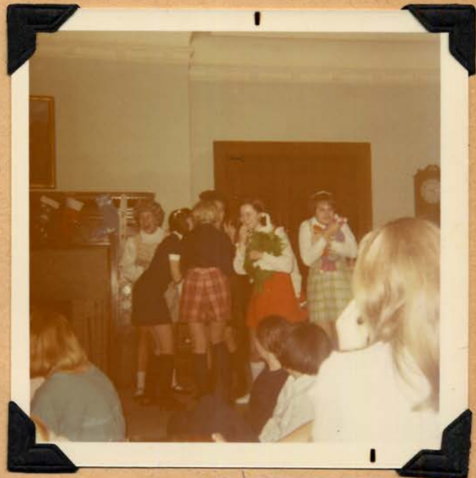
Excitement was every- where.