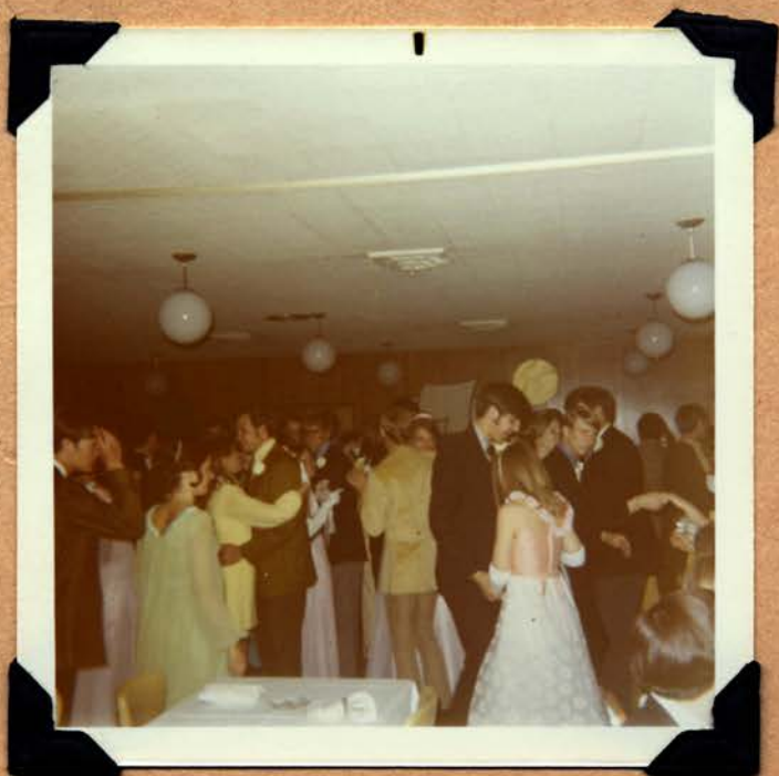
At the dance.