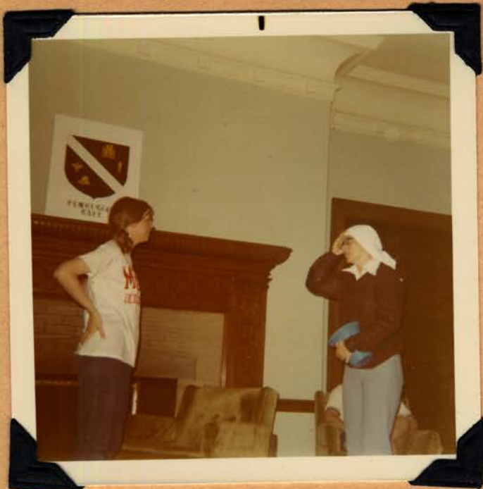
3rd Nu's skit.