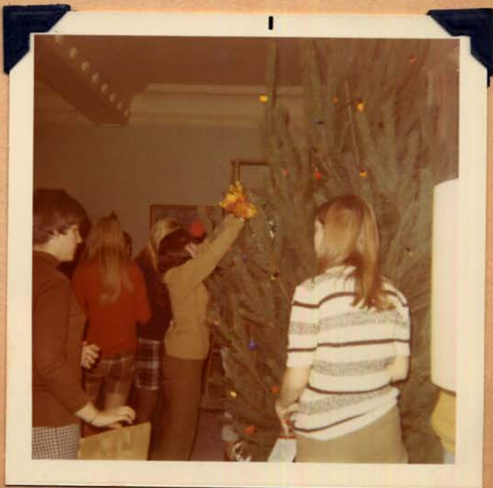
The rest of the Pemites joined in.