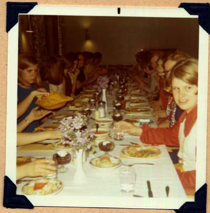
It looks good