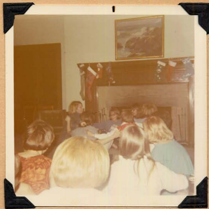
Double your pleasure with friends 2nd Old West