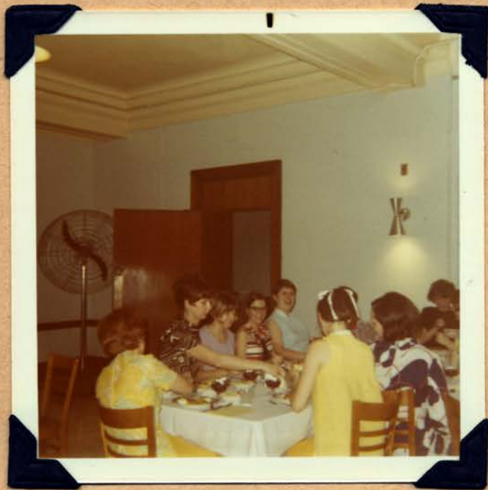
The Head table