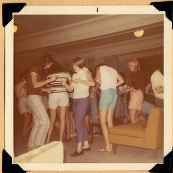
Were you 1:00 or 2:00?