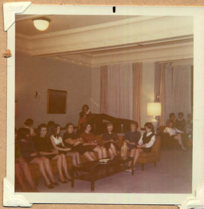
Waiting for dinner