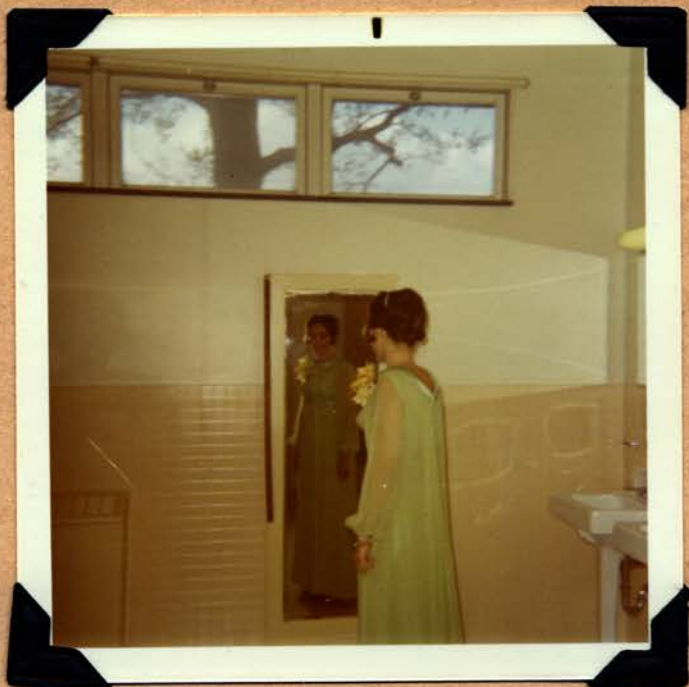
One last check.