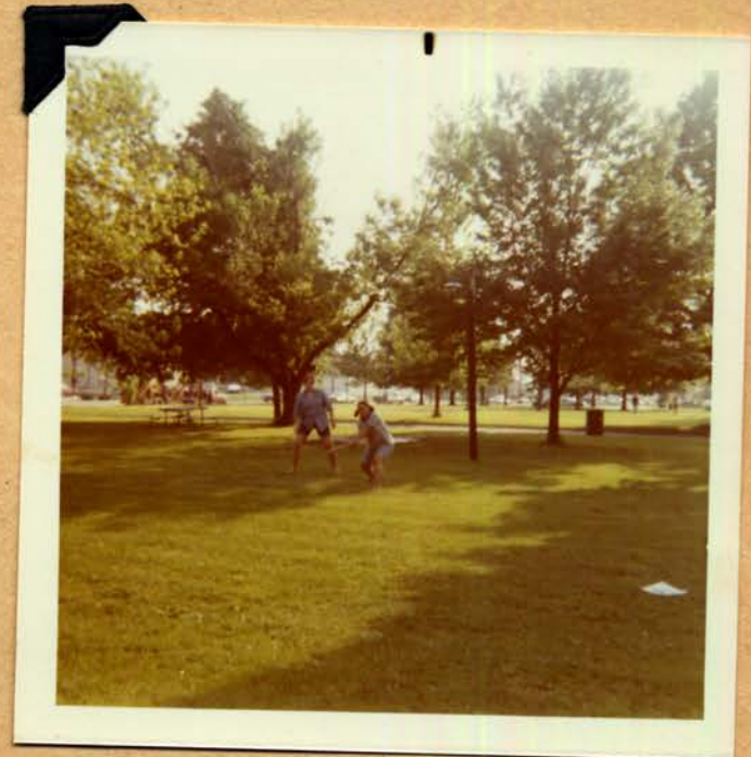
Swing that bat!