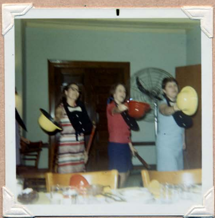
And no dorm like Pem!