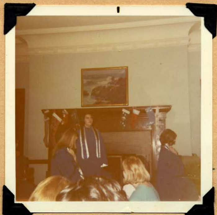
3rd Nu did "Silent Night Holy Night"