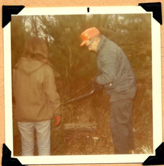
Finding the right Christmas tree was a hard job.