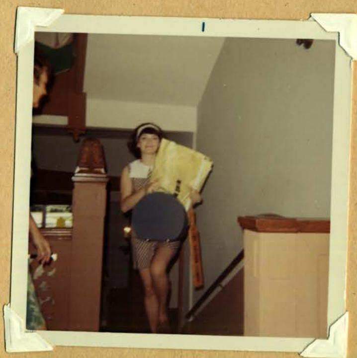
It's my last trip!