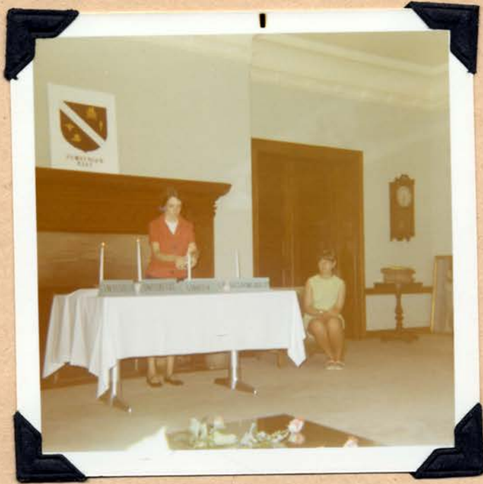
The ceremony begins