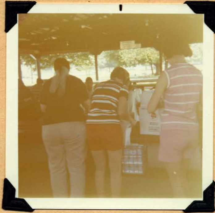
Picking up the lunches