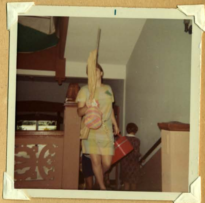
Where are the stairs?