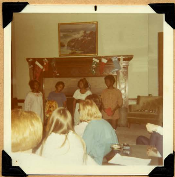
1st & Pit's quartet